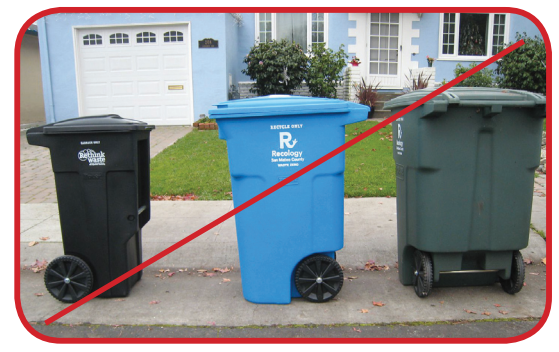
Carts should face the same direction, with the wheels against the curb.