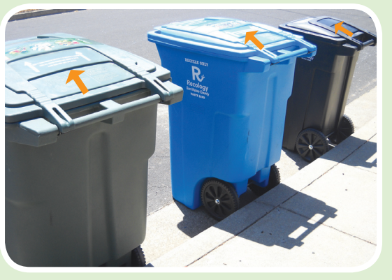
Arrows on lids should point toward the street with wheels against the curb.