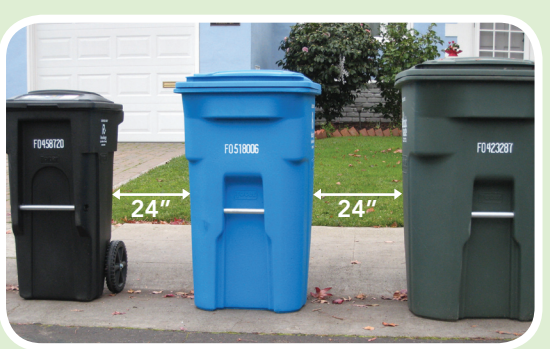
Space carts 2 feet apart.