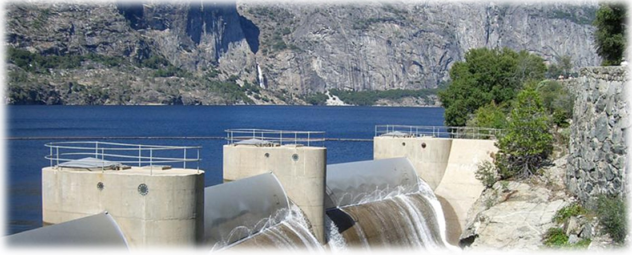
Hetch Hetchy Reservoir