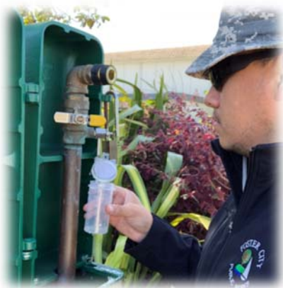
Water Quality Sampling

Drinking water, including bottled water, may reasonably be expected to contain at least small amounts of some contaminants. The presence of contaminants does not necessarily indicate that water poses a health risk. In order to ensure that tap water is safe to drink, the USEPA and the SWRCB-DDW prescribe regulations that limit the amount of certain contaminants in water provided by public water systems. The U.S. Food and Drug Administration regulations and California law also establish limits for contaminants in bottled water that provide the same protection for public health.