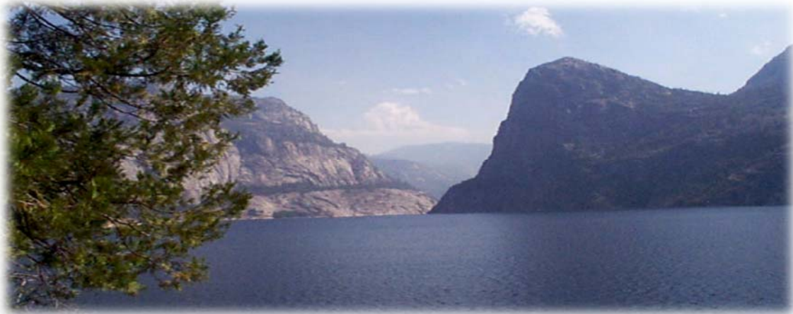
Hetch Hetchy Reservoir