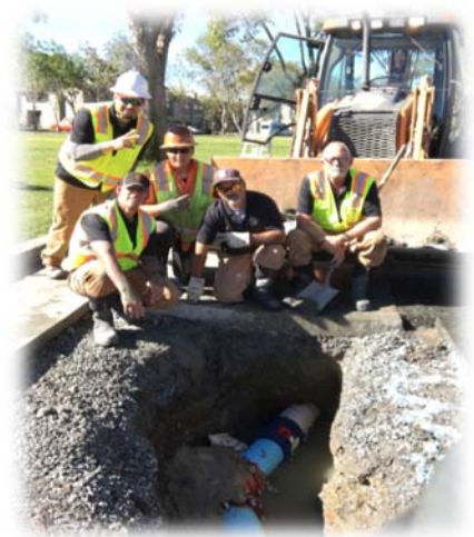
Water Line Repair

More information about contaminants and potential health effects can be obtained by calling the USEPA's Safe Drinking Water Hotline at (800) 426-4791 or at www.epa.gov/safewater .