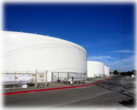
Water Storage Reservoirs