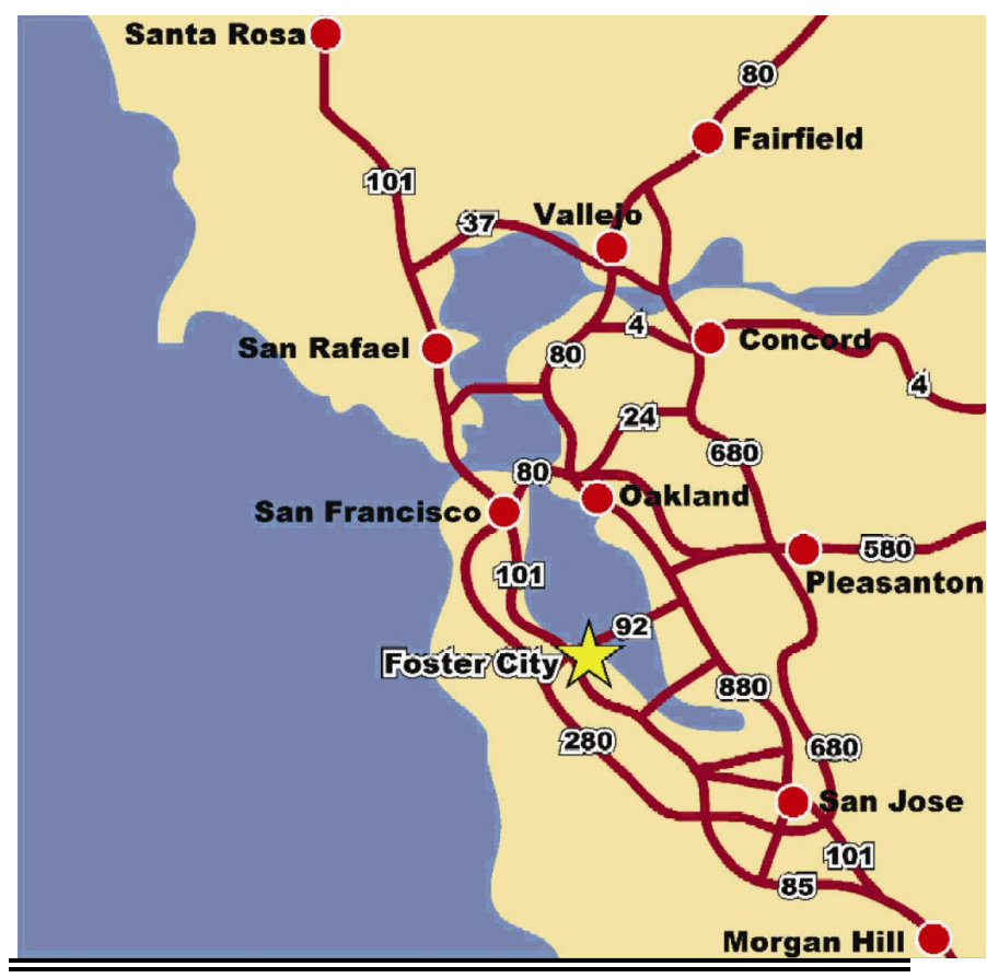
Figure 01: Regional Location Map

Figure 1 shows the regional location of Foster City. Table 2 indicates the travel time from Foster City to various points of interest.