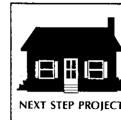
NEXT STEP PROJECT